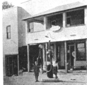
Berman's General Store and P.O.

and later was known as "Berman's General Store", "Post's Store" and "The Old D & H Canal Store".