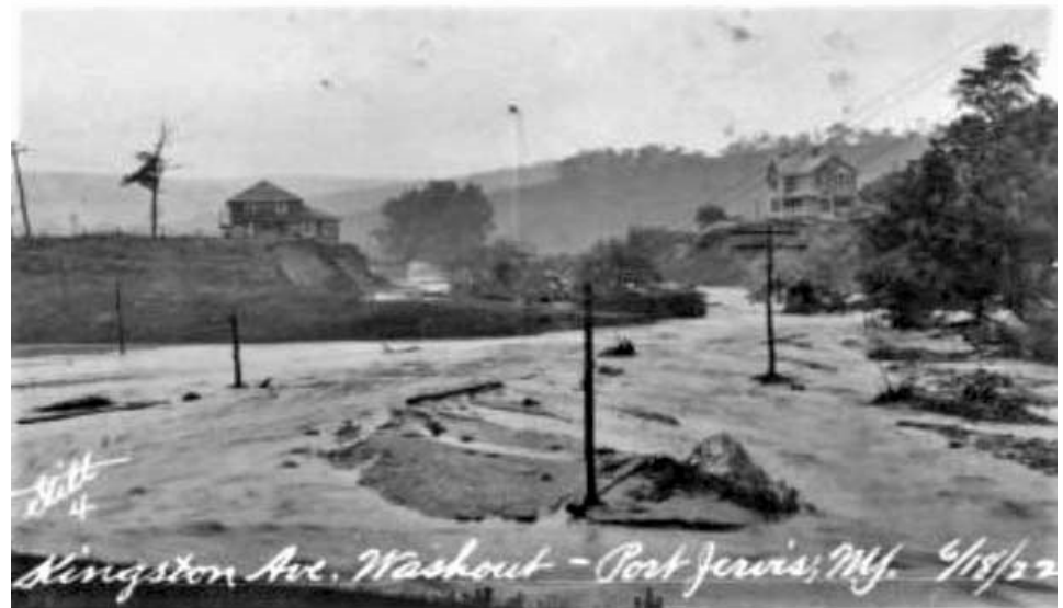
This is the aftermath of the 1922 washout at the intersection of Kingston Ave. and Culvert St. in Port Jervis, NY.

"Other streams overflowing the gullies from uplands above Sparrowbush did damage. One of these floods overturned the waiting station of the trolley and undermined the northeast corner of the Red Men's Hall.